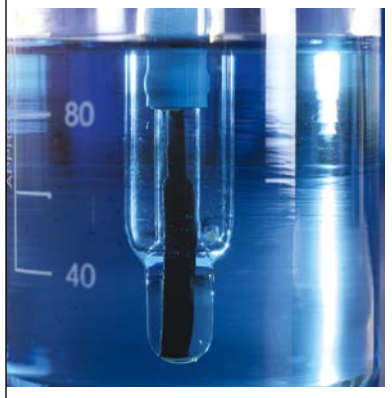
ISM<sup>®</sup> Compatible – Automatic Sensor Recognition

Upon connection of any InLab ISM (Intelligent Sensor Management) sensor, the instrument automaticaly recognizes the sensor and stores sensor ID, serial number, and last calibration data. This reduces the time needed to setup the instrument and reduces chances of error thanks to correct sensor identification.