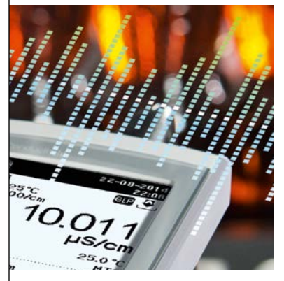
Endpoint Signaling – Attend to Your Measurement

Visual and accoustic signals can be setup to announce warnings, button presses or end-point stability, allowing you to focus your eyes on your ongoing measurement, sample handling, or the moving product line.