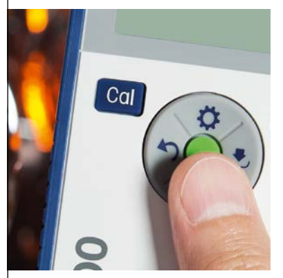
T-pad – Comfortable, Fast Navigation

Seven2Go's new T-pad hardkey buttons with clicker technology improve the speed with which you move through menus and set measurement parameters. The intuitive and faster navigation shortens the time to actual measurement.