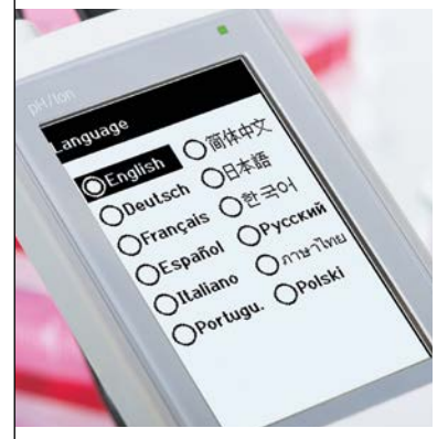
Simple Menu – Intuitive Operation

Seven2Go's new intuitive menu guarantees out-of-the-box operation for anyone. Users no longer need to study lengthy operating instructions. A brief look at the graphical QuickGuide and the instrument is installed and ready for calibration and actual measurement.