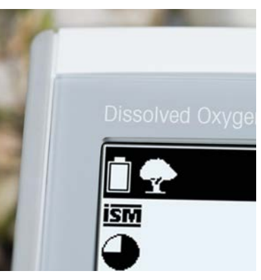
Outdoor Mode – Maximize Battery Life

The outdoor user mode, which comes in addition to the routine and expert laboratory modes, provides users with default instrument settings (e.g. screen brightness sleep mode, and auto-shutdown) that ensure the Seven2Go portable's battery lasts, even if the nearest AA batteries are miles away.