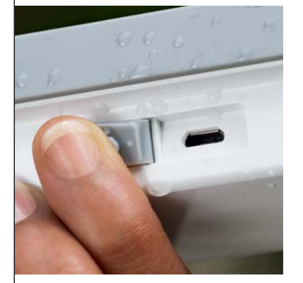
Thanks to its IP67 protection and drop test resistance, the new Seven2Go portables are able to withstand harsh and demanding environments. The weatherproof USB connector ensures data can be transferred safely even after the meter has been exposed to heaps of water.